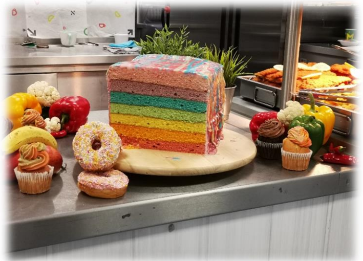
Picture of Rainbow cake in Building four.