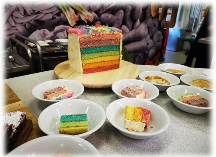
Picture of Rainbow cake in Building five.

As you all know we were learning about Pride Week last week. This is the fantastic cake from our catering team. Which was one of the many jesters shown to demonstrate the expectation of all students and staff in line with our learning.