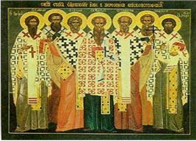
The Holy Hieromartyrs of Cherson: Basil, Ephraim, Capito, Eugene, Aetherius, Elpidius, and Agathodorus commemorated on 7 March .