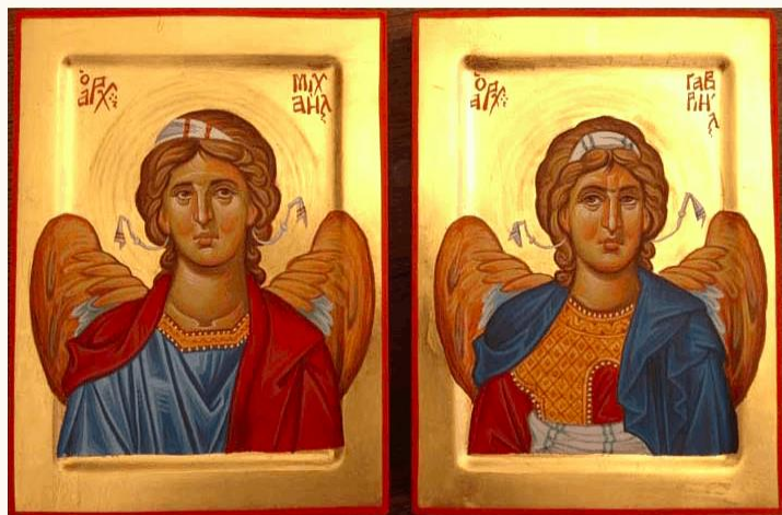
Synaxis of the Taxiarchs and Archangels Michael and Gabriel.