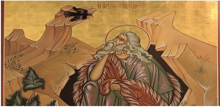
Feast Day of Prophet Elias.