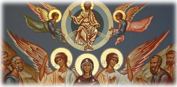
Icon of the Feast of the Ascension of Christ-St Paul Orthodox Church