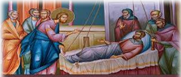
4TH SUNDAY OF PASCHA SUNDAY OF THE PARALYTIC