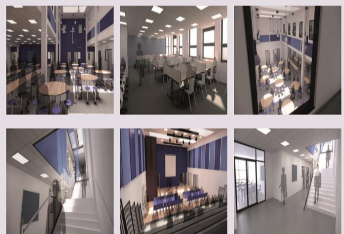
CGIs of proposed internal spaces