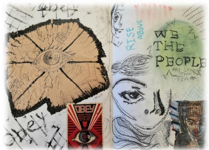
Lulu K (11S)