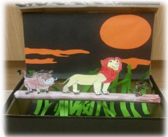
Christos P (8M)

I found it difficult to get the drawings and waves to stay upright and had to use a lot of cello tape. The set can be changed into a space battle scene or interior of the Death Star by removing the orange scenery and buildings. Zac W (7E): Evaluation piece