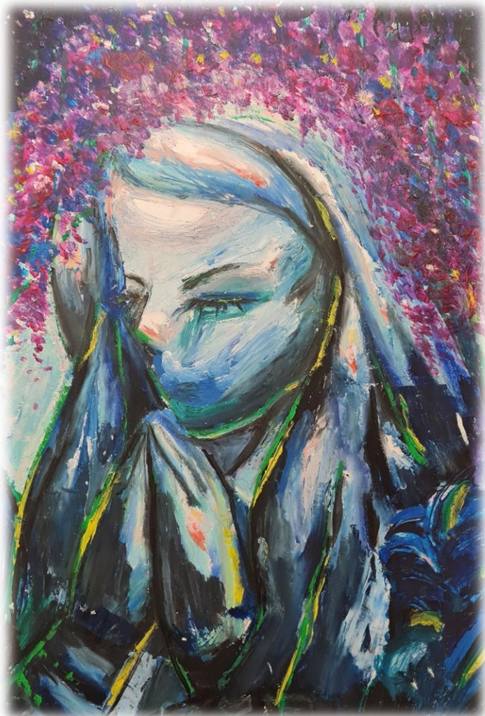
Twyla N (11S)