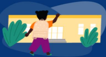
When you arrive at school