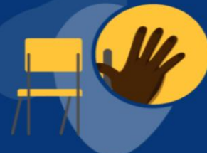
After touching surfaces