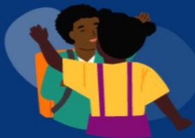
After embracing others