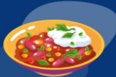
Before eating food