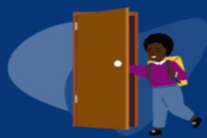
Before you leave school and when you get home